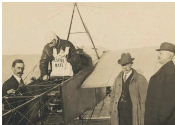
National Library of Australia

Only a few weeks later World War I broke out and this remarkable flight was almost forgotten.