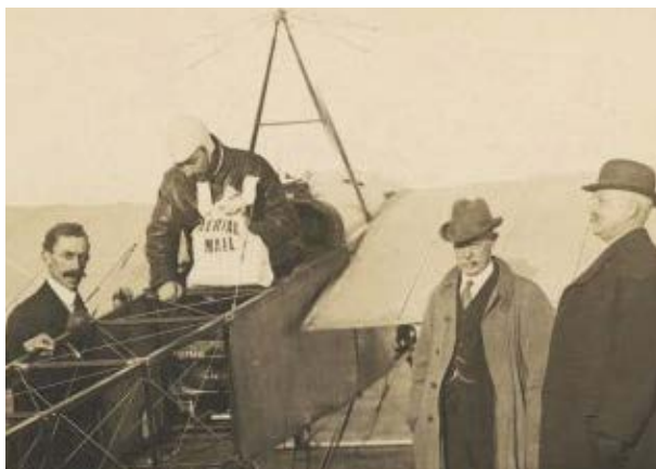
National Library of Australia

Only a few weeks later World War I broke out and this remarkable flight was almost forgotten.