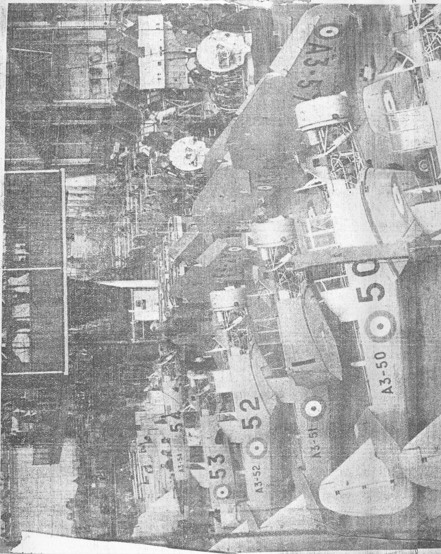
SYDNEY MORNING HERALD 27.9.41