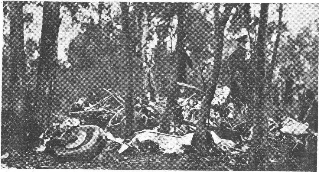
Mute evidence of the tragic crash of the R.A.A.F. Avro-Anson bomber, in which the crew of four lost its lives on Friday afternoon at Riverstone, New South Wales.