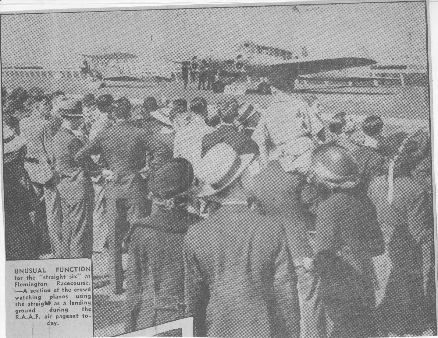
UNUSUAL FUNCTION for the "straight six" at Flemington Racecourse. —A section of the crowd watching planes using the straight as a landing ground during the R.A.A.F. air pageant to- day.