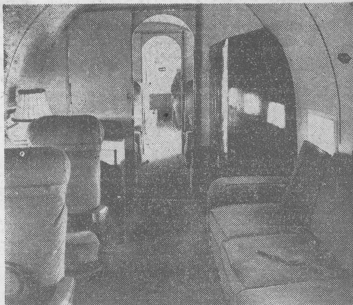
GOVERNOR-GENERAL'S PRIVATE PLANE: All the conveniences of a small flat are included in Mr McKell's Dakota, now ready for service. Picture taken at Laverton yesterday shows the comfortable lounge. Colour scheme is white and burgundy.