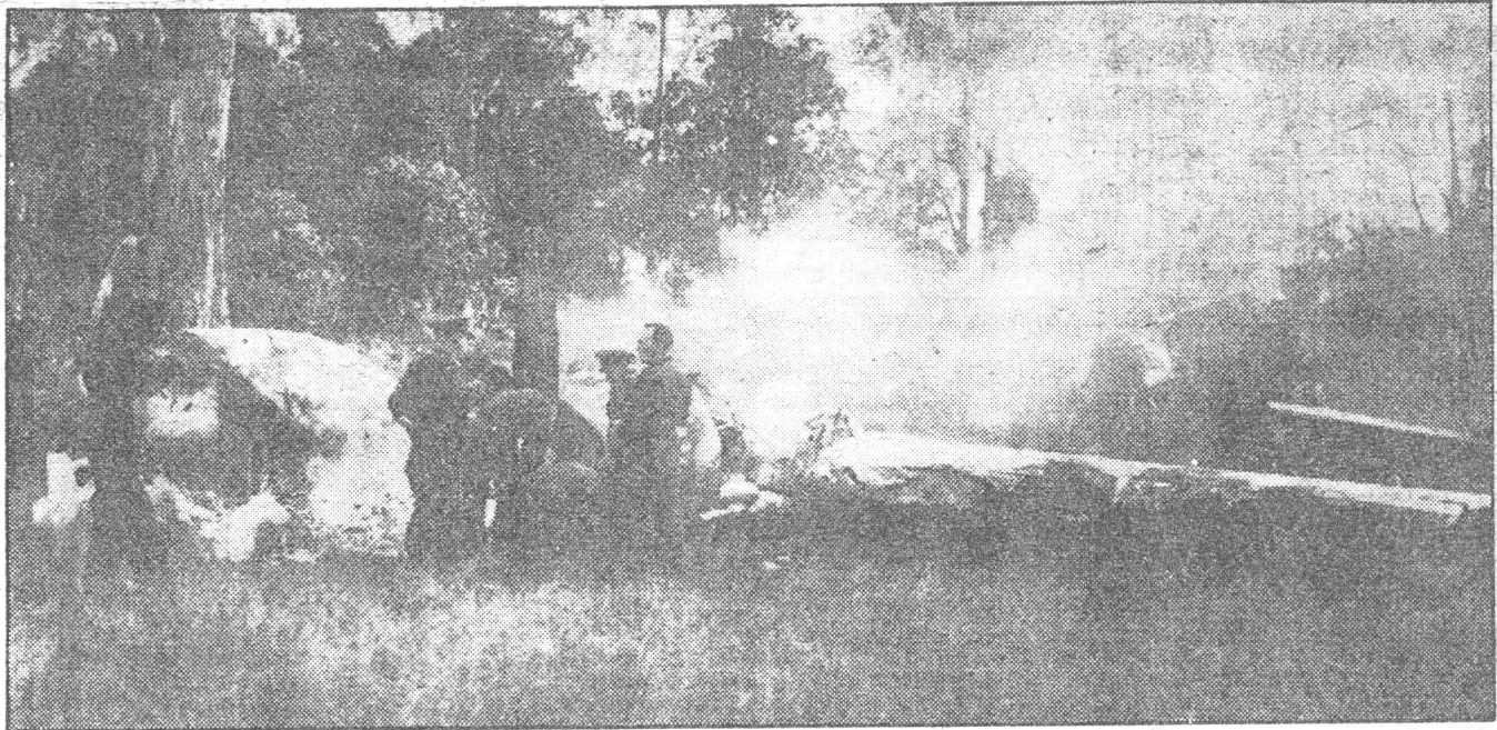
PLANE CRASH. Three men escaped from this plane when it crashed at Rooty Hill today.