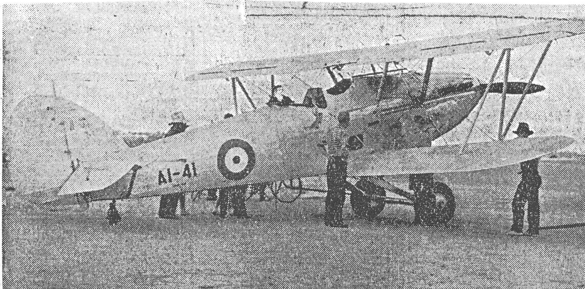
THE R.A.F. HAWKER DEMON, companion plane to that which crashed at Townsville last week, snapped yesterday at Connor Park airport on its return South.