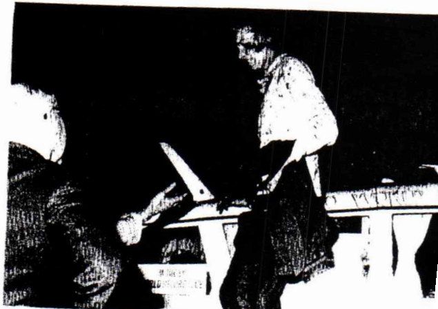
British Flyer Miss Sheila Scott is greeted by Club Officials on arrival.