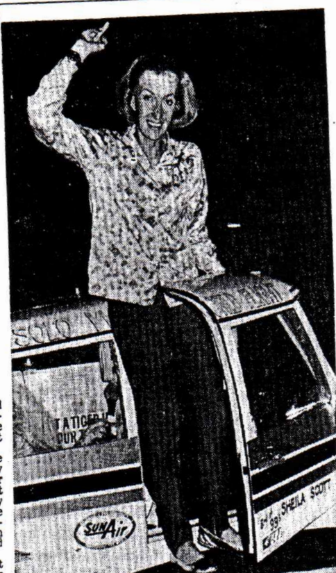
SHEILA SCOTT standing on the wing of her plane after getting out of the cockpit on arrival at Mascot yesterday.

She says she is not superstitious — 13 is her lucky number — but she carries an insignia "Myth" on the side of the plane and always has.